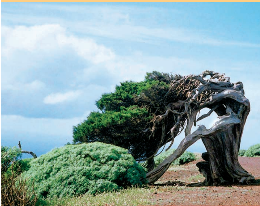
A 'rain tree' on El Hierro.