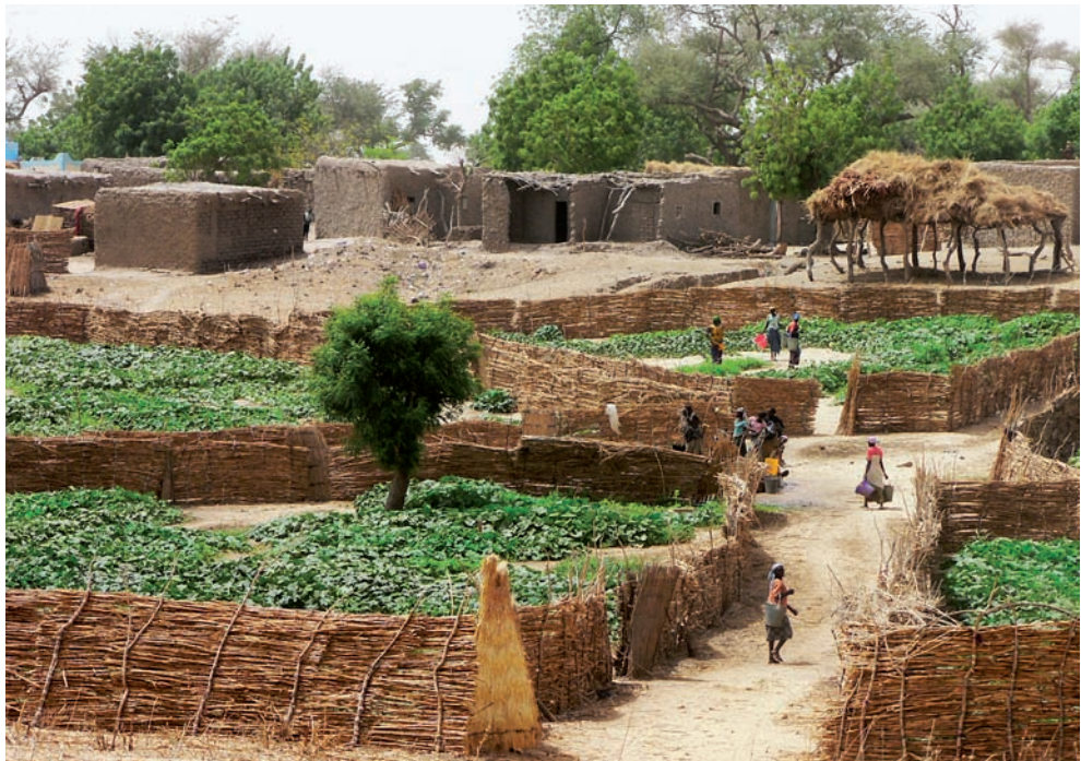
Irrigated gardens in a valley bottom in the dry season in Niger.

Perception of the climate is a key component of popular understanding of climate change. For example, farmers in the Sahel brought back practices that existed before the great droughts of 1970 to 1980, showing their observation, perception and response to the return of the rains since the end of the 1990s. Multidisciplinary scientific work seeks in particular to show all the dimensions involved in representations of changes and risks. For example, the perception of rainfall is related to water requirements and hence to farming systems, water management, etc. When the water requirements of a farming system increase, as is the case in particular of commercial soya and maize crops, the